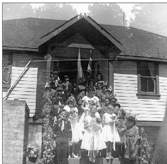
Cubs, Brownies and "royalty" with plenty of flowers at this 1963 Pender School celebration. (Today's Nu-To-Yu steps.)

The museum provided online access to highlights of the islands' school-related archives, including photos and documents. Since start-up in mid-April, the group has been popular, attracting 149 members with 170 posts, comments and reactions.