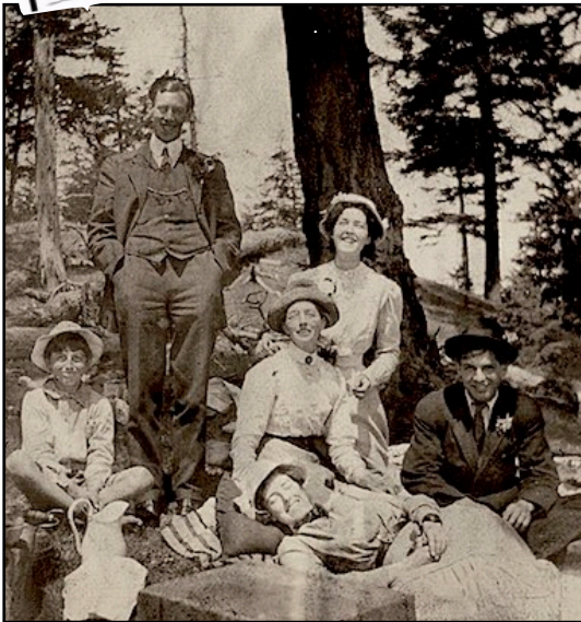
Pender families have always loved picnics, games and get-togethers. We have old photos like this one to prove it! On July 29th, the museum is recreating this much-loved tradition.

One More Reminder: Family Fun Day is Sunday, July 29th from 1-4pm